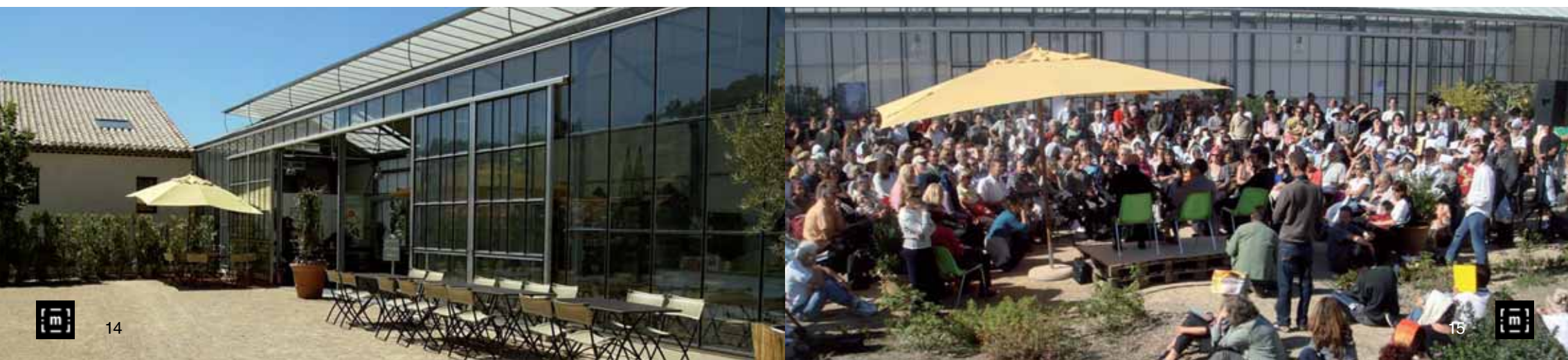
The Esplanade Central part